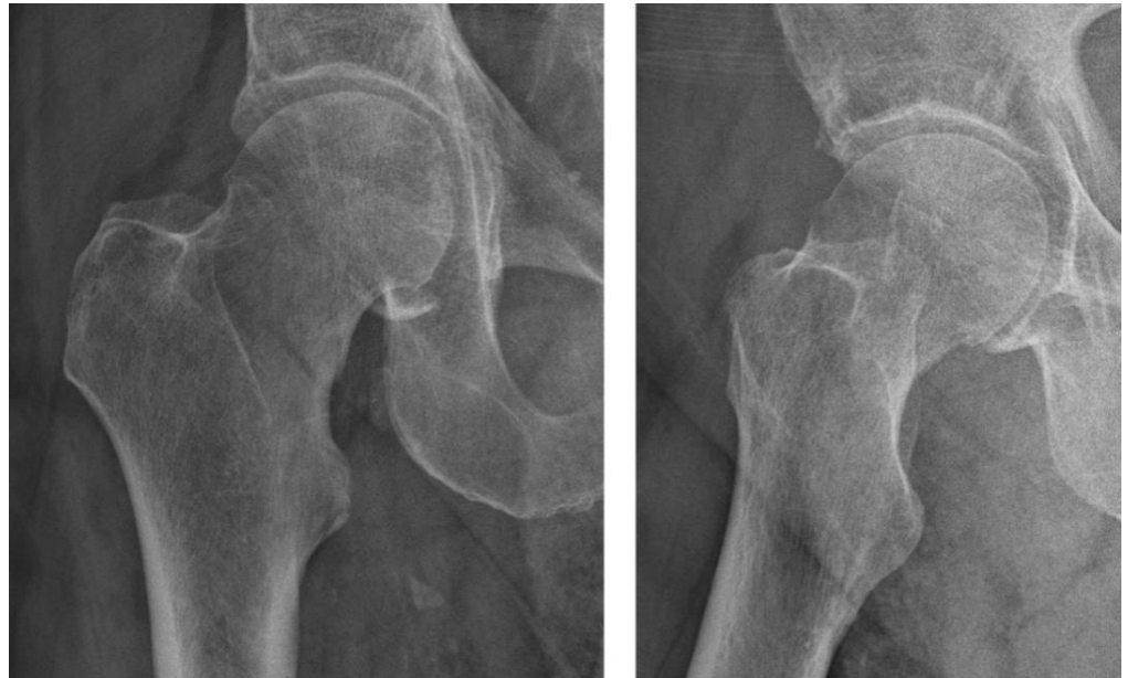
Figure 2. Plain radiograph of the right hip showing no clear signs of a fracture. The doctor then performed an X-ray imaging of the hip, which did not give clear signs of a fracture. Occult fractures are a type of nondisplaced fracture, which are not visible on plain radiographs or, sometimes, computed tomography (CT). This makes them prone to diagnostic errors, requiring a detailed anamnesis and clinical examination. The prevalence of such fractures is relatively high among children [10], whereas in adults the prevalence is under 10% [11,12]. An occult fracture should always be suspected when clinical symptoms and examination do not match the radiographic finding [12]. After X-ray, the next diagnostic step is the CT, which does not always exclude a false negative result. In addition to plain radiographs and CT, magnetic resonance imaging (MRI) plays an important role. Unfortunately, facilities equipped with MRI scanners are not available nationwide in all countries, and the cost–benefit has not yet been proven [13].